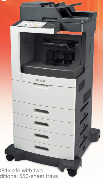
MX81x dfe with two additional 550-sheet trays